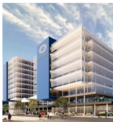
Creighton University Health Services Campus coming in 2021