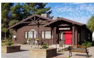
Front Exterior after Restoration