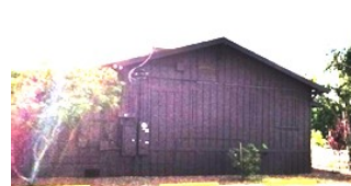
Rear Exterior after Restoration