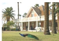
Sahuaro Ranch Guest House