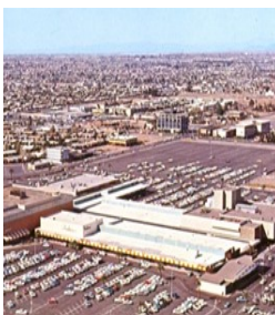
Park Central Mall, 1956