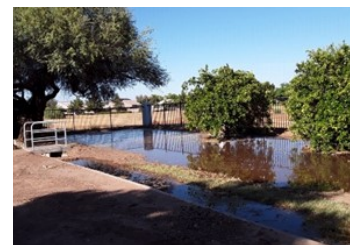
Proper Irrigation after Repairs