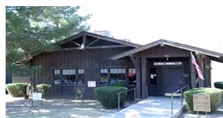
Exterior before 2019 Restoration