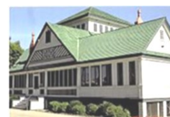
Manistee Ranch House