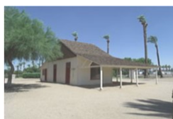
Sahuaro Ranch Adobe House

Tours are conducted by the Glendale Arizona Historical Society docents from October through May: noon to 4 pm (last tour starts at 3 pm). Fees: Adults $5, Seniors $4, Veterans, $4, and children ages 6-16 $1. GAHS MEMBERS ARE FREE . The 2019-20 tour dates are the 1 st and 3 rd Saturday of the month on the following dates: November 2 nd , and December 7 th and 21 st .