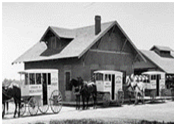
Dairy, Early 1900's