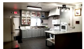
Kitchen after Restoration