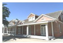
Sahuaro Ranch Main House