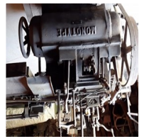
Our "Curious" Monotype