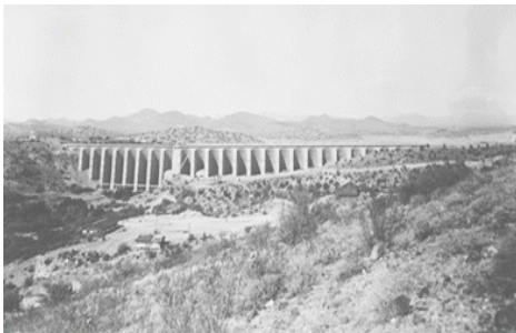
1927 Waddell Dam