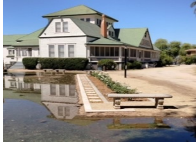
COMPLETED NEVER FORGET GARDEN April 30, 2022