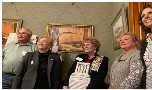
JAN. 24, 2022 DAR Donation