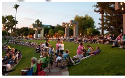
Murphy Park in Historic Downtown, a beautiful, versatile year-round destination

Currently, the downtown merchants and city officials are discussing what can be done to improve the viability of the downtown. How can Murphy Park contribute to a stronger and more successful downtown?