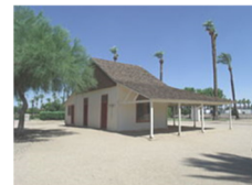
Sahuaro Ranch Adobe House