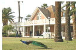
Sahuaro Ranch Guest House