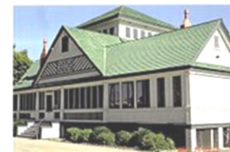
Manistee Ranch House