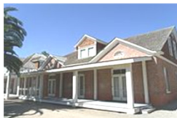
Sahuaro Ranch Main House